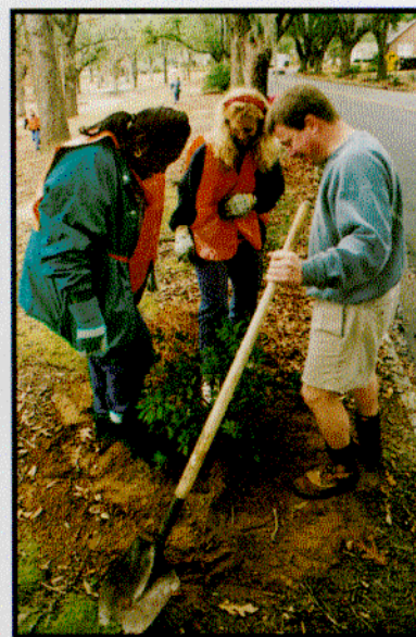
PLANTING NEW LIFE: With neighborhood residents, the hospital is working to beautify and improve an inner-city area.