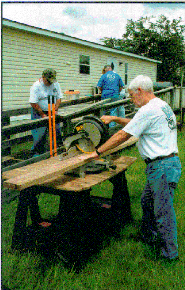
RAMP BUILDERS: A crew of 10 gathers twice a week to build ramps for disabled people, many of whom are discharges from Phoebe Putney. Since the hospital joined with the local council on aging in 2000 to construct the ramps, more than 400 of them have been added to homes, improving safety and quality of life for disabled residents.