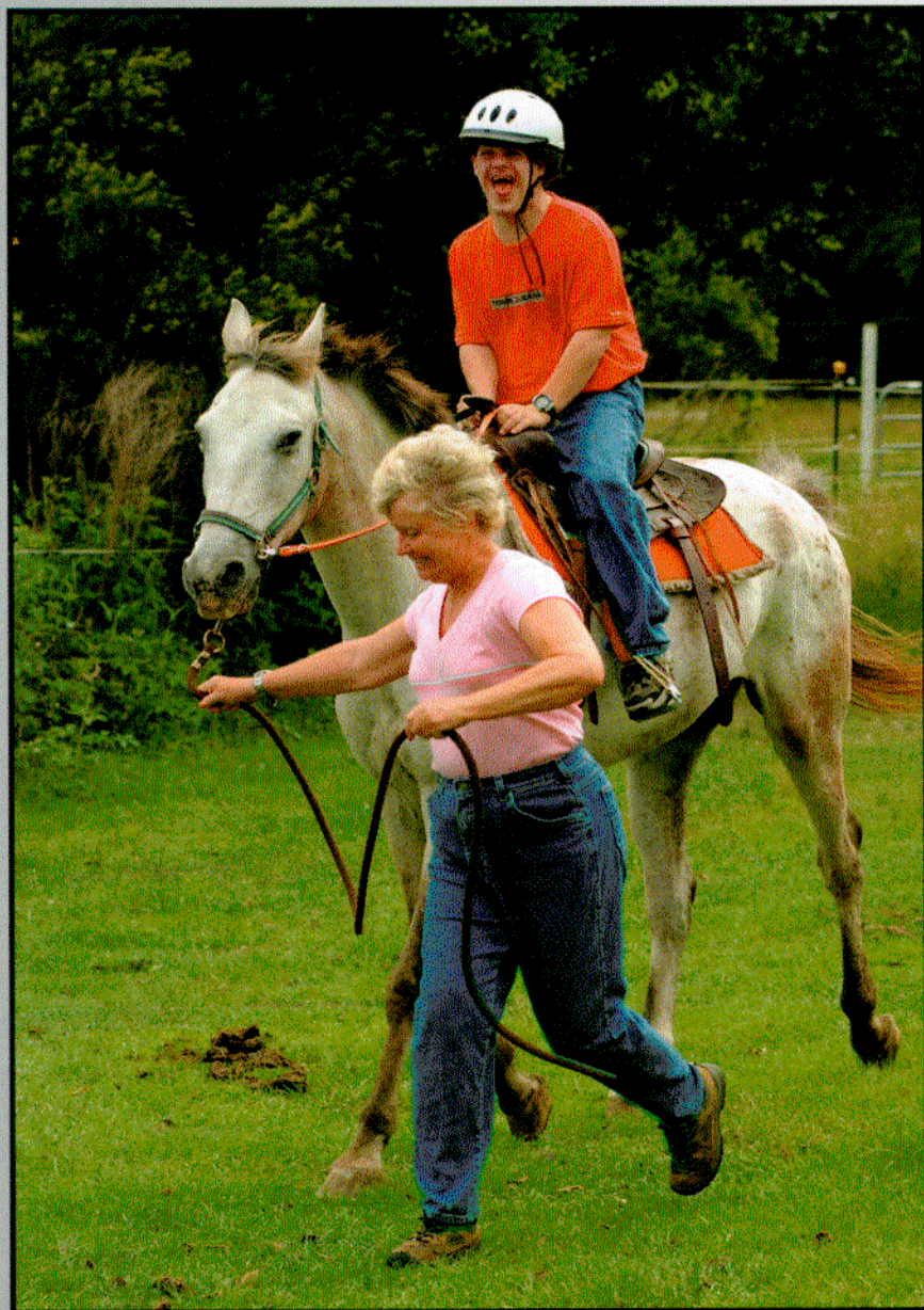
RIDING REHABILITATION: A therapeutic program uses equine-oriented activities to help children with physical, emotional, mental and social problems. It links and uses the resources of the school system, parents, volunteers and a number of organizations.